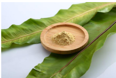
JABARA peel powder

We hope that more concrete results will be obtained in recent years from the high-precision monitor surveys that followed last year and the year before.