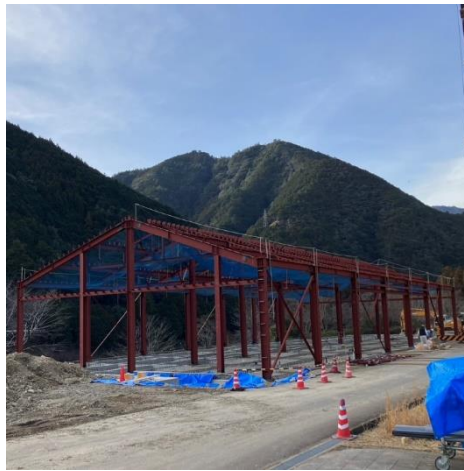
A state in the middle of construction of a new JABARA processing plant

Since it will be possible to increase the operating rate of the processing plant, it is expected to secure employment in the village.