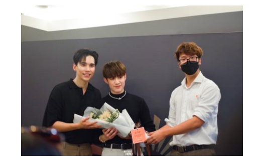
Start Bakery Shop